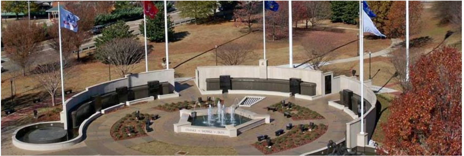
Huntsville Madison County Veterans Memorial, Huntsville, Alabama