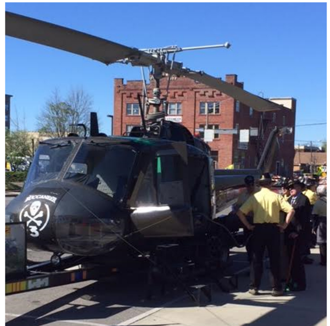
BUC 3 on display in Huntsville.

The Vietnam Veterans of America, Huntsville Chapter 1067 has close to 470 active members. The North Alabama Chapter of the Vietnam Helicopter Pilots Association has approximately 70 members.